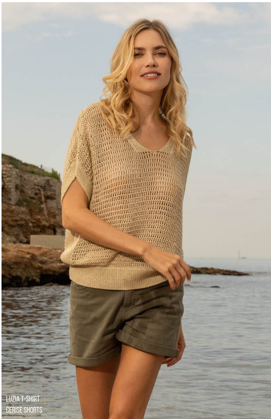
LUZIA T-SHIRT CERISE SHORTS