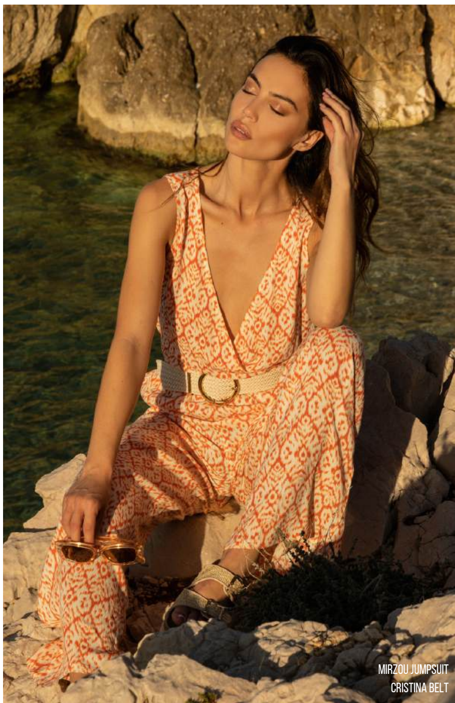
MIRZOU JUMPSUIT CRISTINA BELT