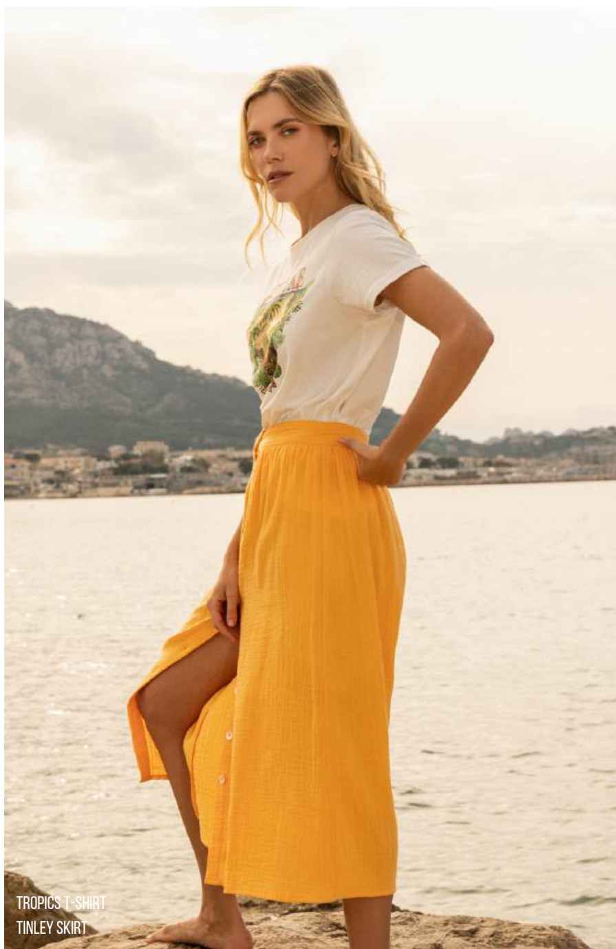
TROPICS T-SHIRT TINLEY SKIRT