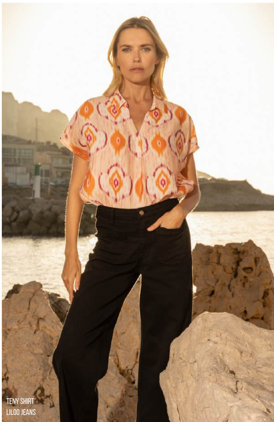
TENY SHIRT LILOO JEANS