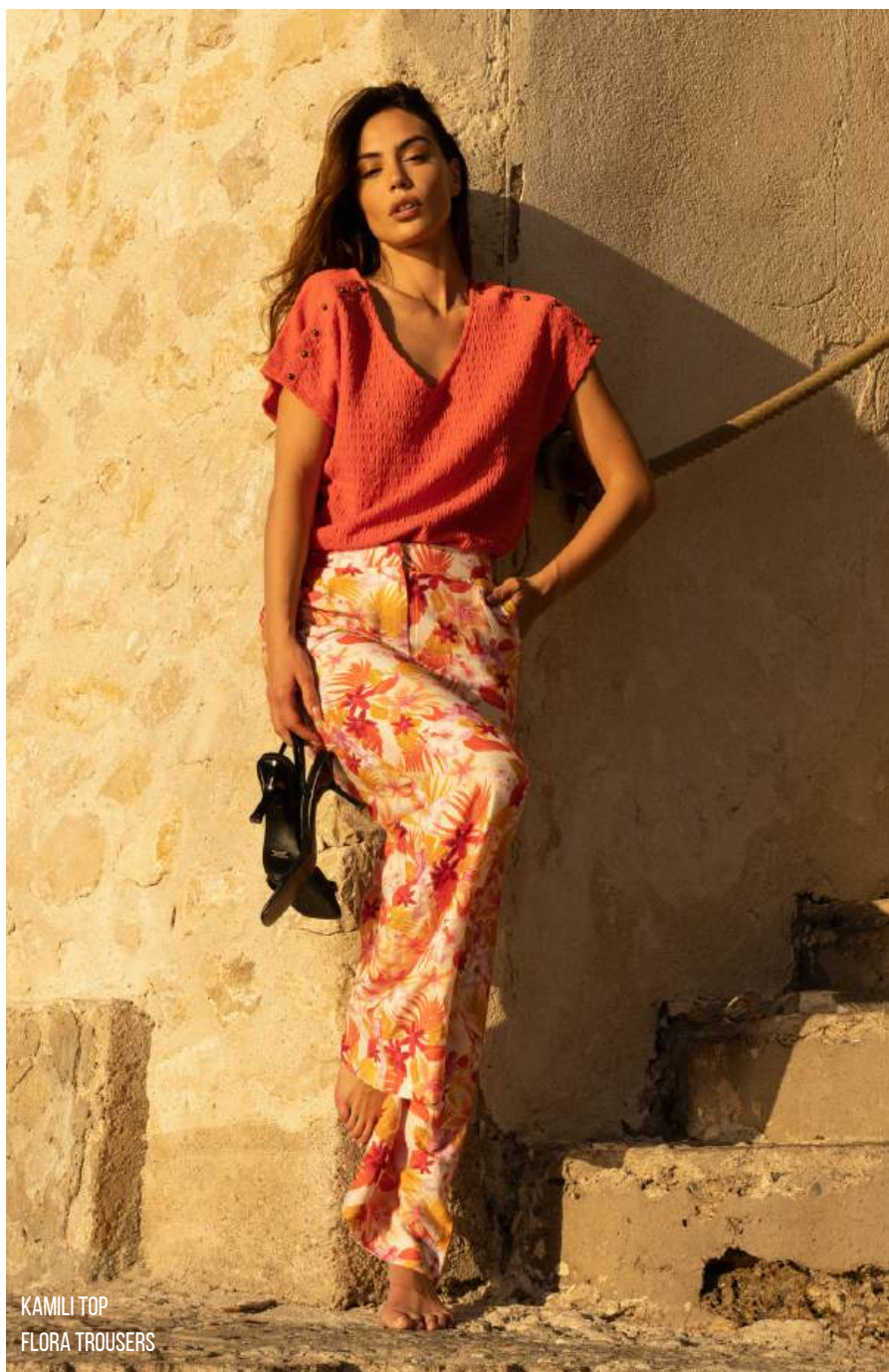
KAMILI TOP FLORA TROUSERS