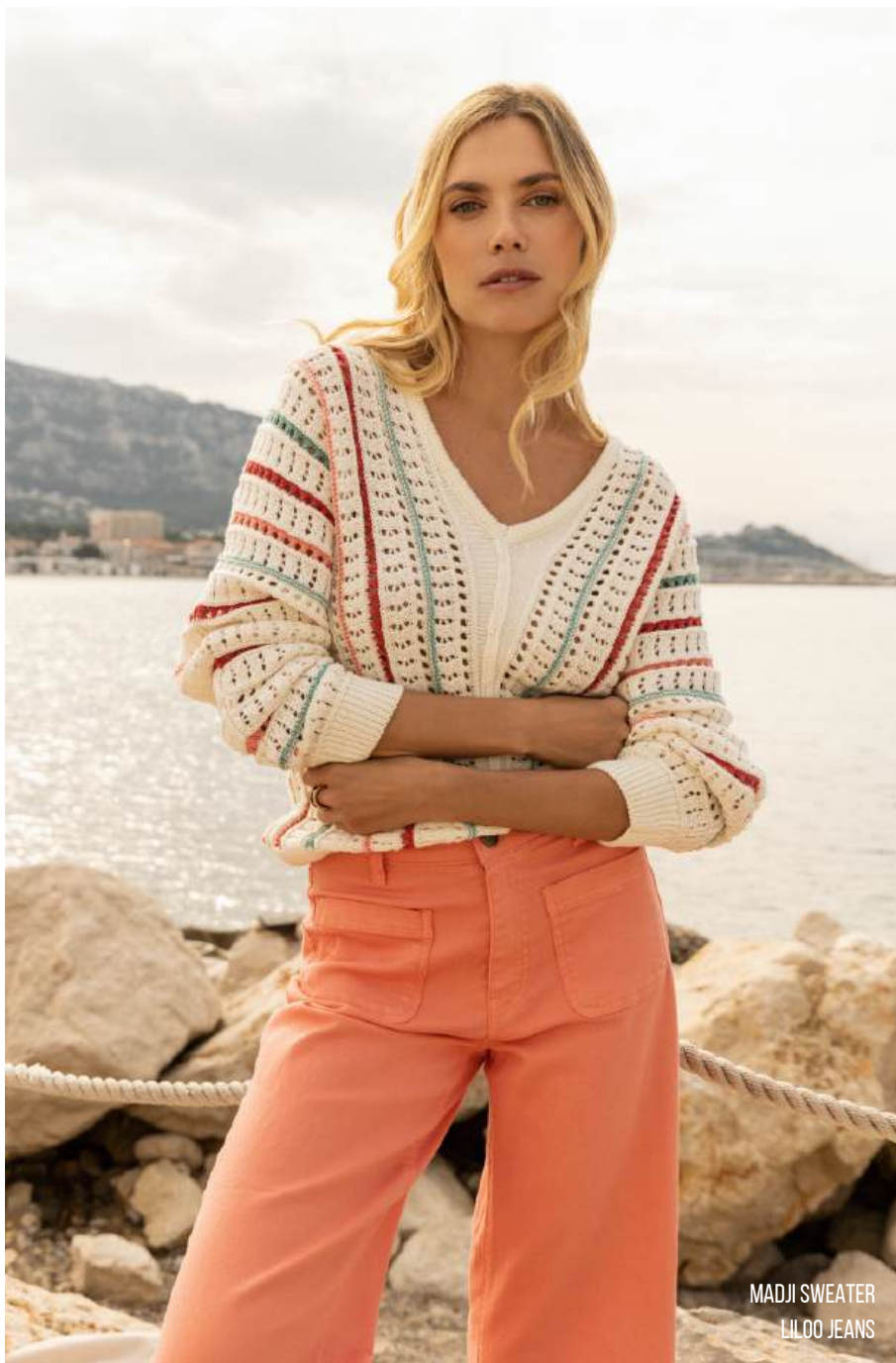
MADJI SWEATER LILLOO JEANS