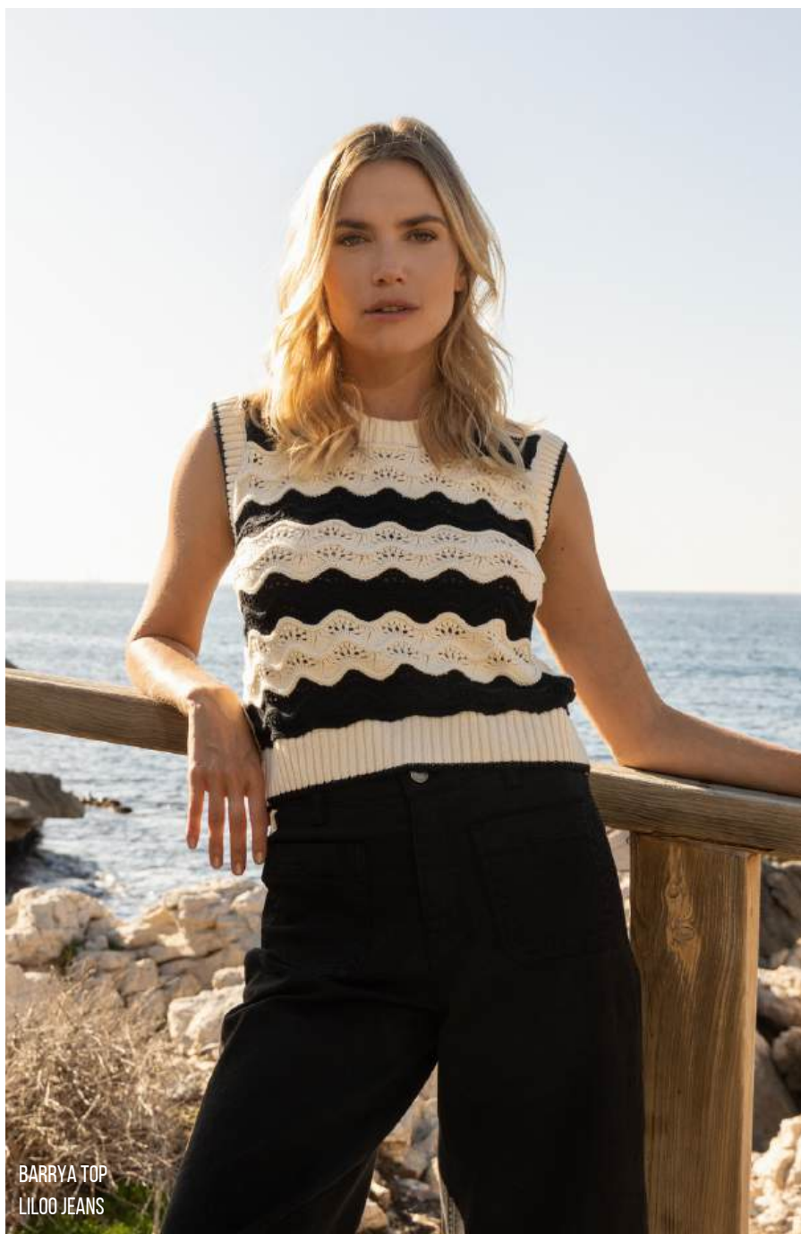
BARRYA TOP LILOO JEANS