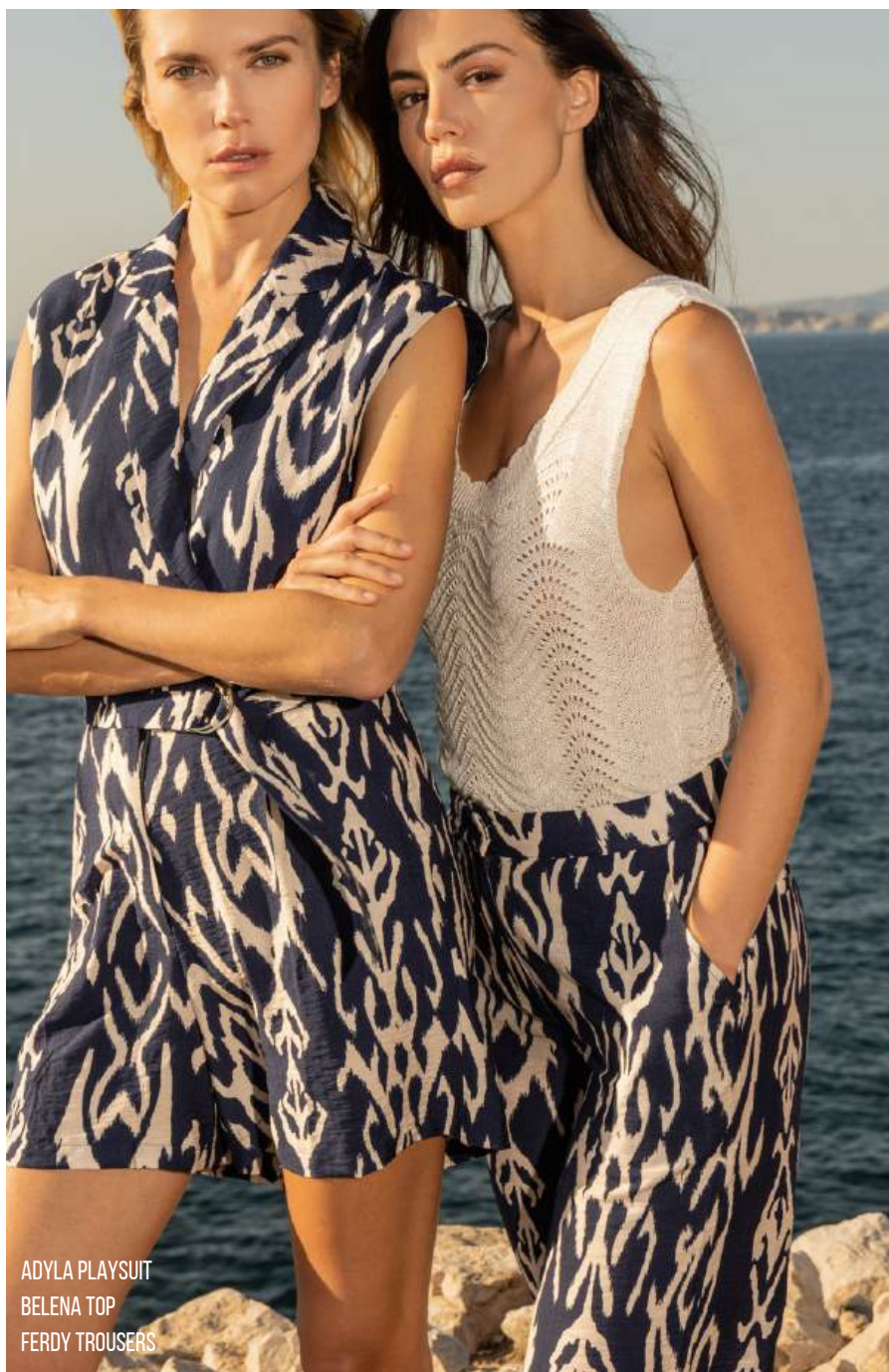
ADYLA PLAYSUIT BELENA TOP FERDY TROUSERS