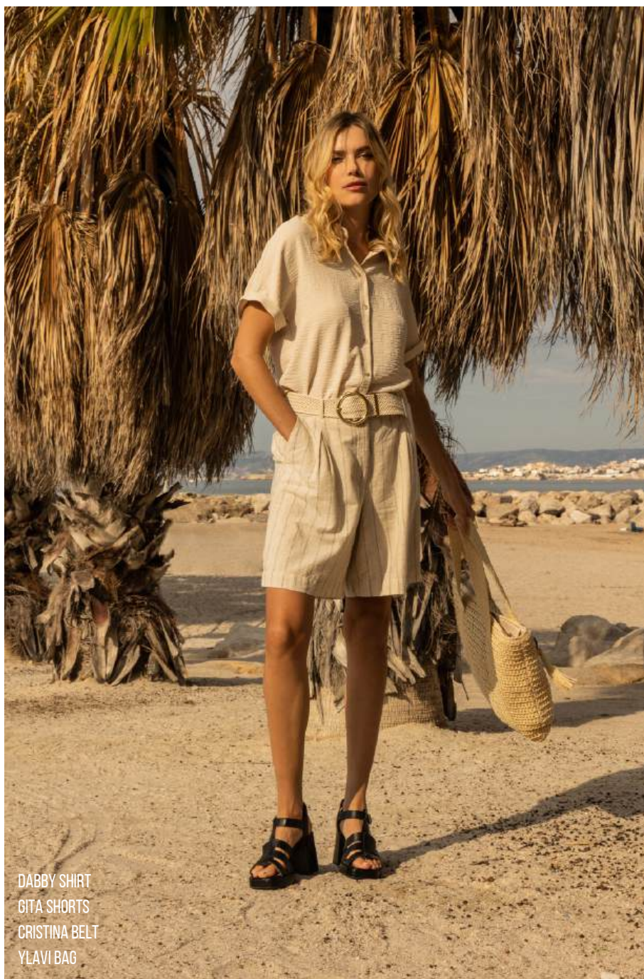
DABBY SHIRT GITA SHORTS CRISTINA BELT YLAVI BAG