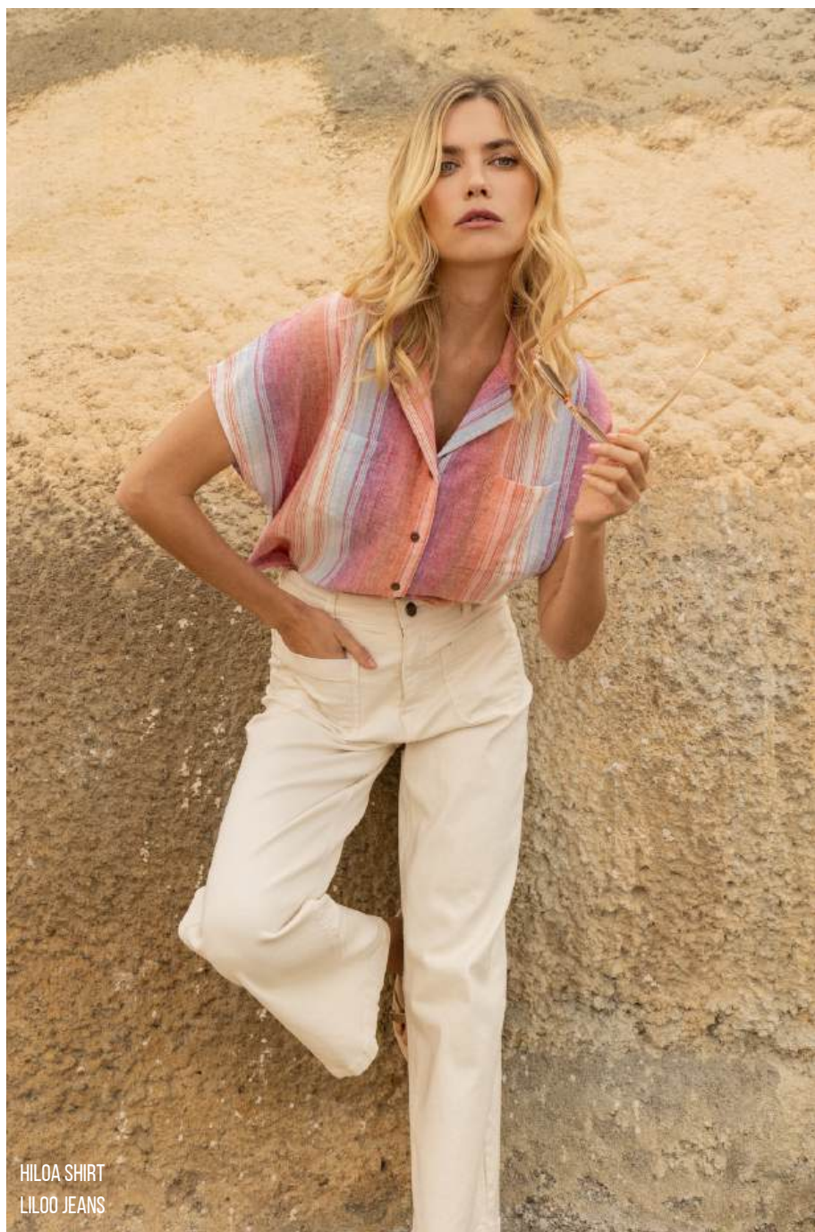
HILOA SHIRT LILOO JEANS